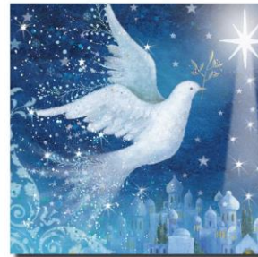
Dove over Bethlehem (116x160mm) £3.50