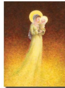
Mary & Boychild (140x140mm) £3.50