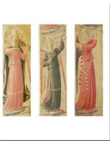
Angels (116x160mm) £3.50