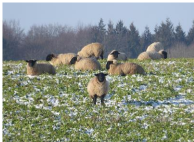
Sheep in a Hampshire Meadow (116x160mm) £3.50