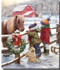
Visiting the Pony (116x160mm) £3.50

All profits from the sale of these cards will support our work in protecting a thriving Hampshire countryside. Thank you for your support.