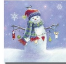
Snowman (140x140mm) £3.50