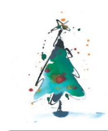
The Tree (116x160mm) £3.50